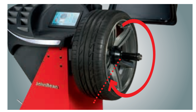
Stop in position