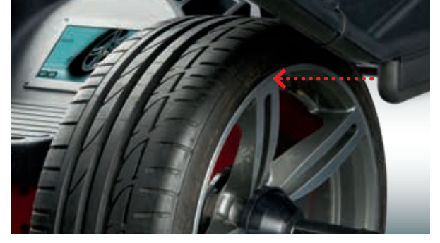
Smart Sonar ™

Patented automatic Power Clamp ^{\text{\tiny M}} electromechanical clamps the wheel accurately with a constant force, reducing the opportunity for chasing weight.